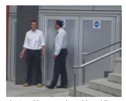
the 'smoking space' outside public buildings