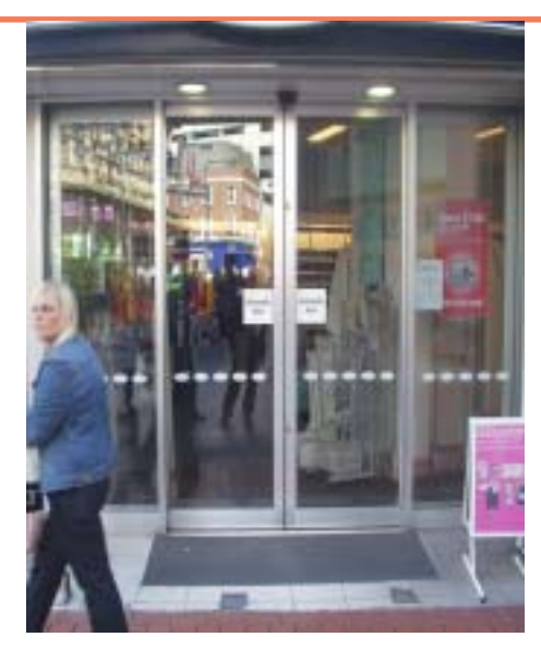
automatic doors are of benfit to all not iust the disabled

The goal of inclusive design, conscious of difference and diversity, is more than simply access rather it is the creation of an environment that is not structured on the oppression of the disabled or other groups. To do so it must look at the underlying assumptions and theory that generate its form and aesthetic. In our urban environment where we understand place in terms of the social as well as physical environment turning circles for wheelchairs, disabled parking and induction loops are insufficient to provide a genuinely inclusive environment. Street activities like skateboarding, freerunning and flash-mobbing challenge the ability of the environment to dominate the individual. Sennett