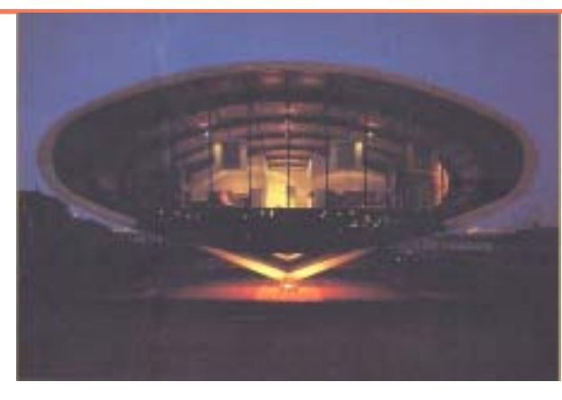
raised above the ground Alsop's Cardiff Docks Visitor Centre requires steps and a ramp for access

If the form of the table (and its environment) is predicated on the underlying (ablist) structures of society the idea of the domestic object, owned and understood by most members of society, which it embodies might be more useful in developing a theory. It removes the architect/designer from the position of