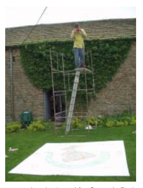
creating the 'story' for Queen's Park

Through this study I have become convinced that in order to achieve inclusive design consultation should form a larger part of my practice. My proposal for Queen's Park is thus deliberately presented as a the development of a scheme - a series of photographs show a 2.4 x 2.4 m marker pen drawing with models placed upon it developing alongside a story. The scheme includes aspirations for visual and tactile wayfinding and in the knowledge that these and other ideas could only be developed through consultation I have allocated, within the budget, an amount for such a process. In pursuit of this element of consultation I have taken a risk in submitting a fairly open design when I suspect the clients would prefer a well worked up proposal.