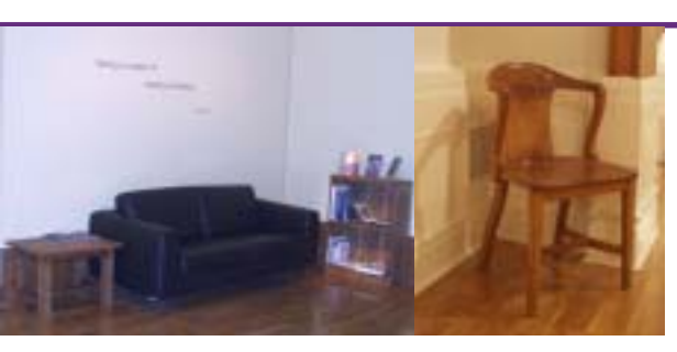
other seats in the Graves Art Gallery