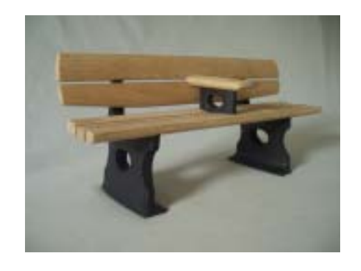
models can convey a scheme in an understandable and accessible form

The competitive nature and short time scale of many of my commissions makes consultation difficult and only in the Graves project did the design evolve significantly