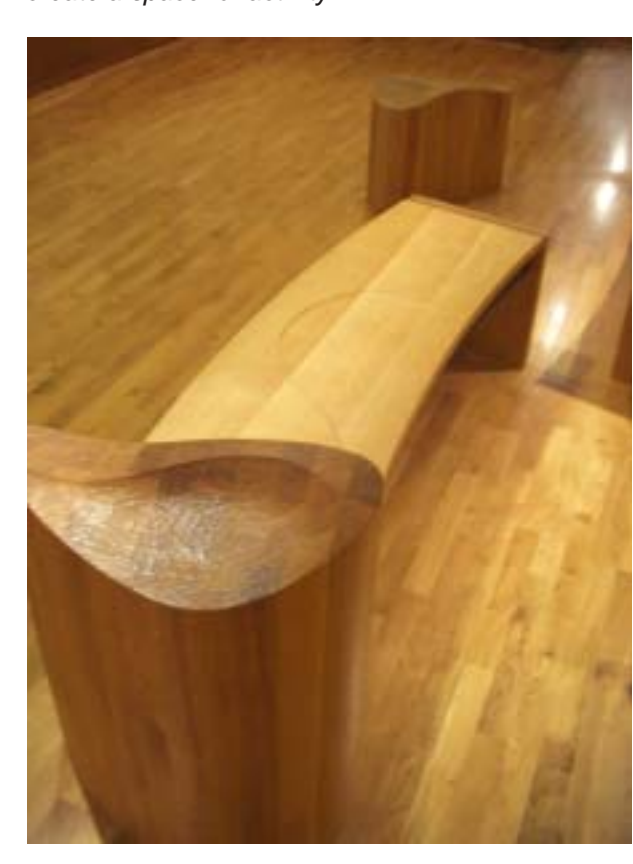
the form of the Graves seats is related to the body

sitting activities involve both sitter and companions